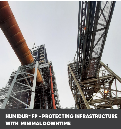
HUMIDUR ® FP - PROTECTING INFRASTRUCTURE WITH MINIMAL DOWNTIME

HALVING YOUR CORROSION COSTS WITHOUT COMPROMISING QUALITY