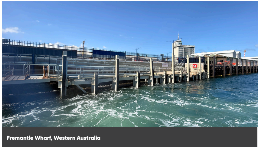
Fremantle Wharf, Western Australia

TAMS Group was engaged to complete a protective coating scope as part of works at Fremantle Wharf. The marine environment presented inherent challenges, including exposure to moisture, salt, and variable conditions that can impact coating performance and application efficiency. Selecting a coating system that could deliver the required protection while fitting technical support and a suitable coating solution that balanced performance, application speed, and overall cost efficiency within the project schedule was critical. Matrix Coating Technologies was engaged to provide technical support and a suitable coating solution that balanced performance, application speed, and overall cost efficiency.